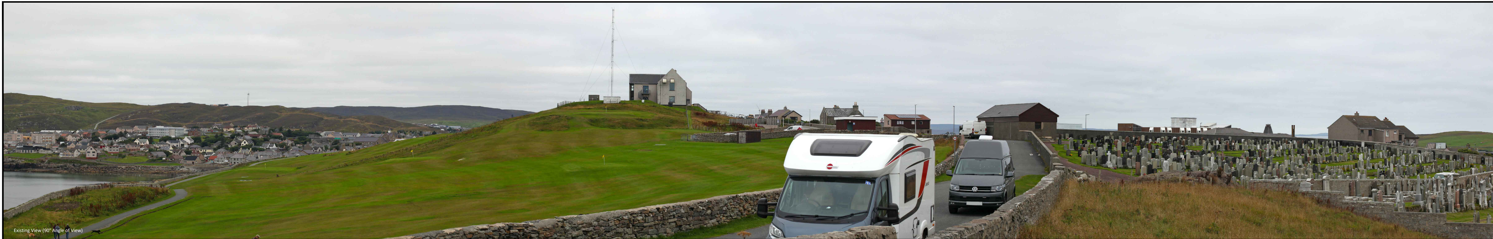
Existing View (90° Angle of View)