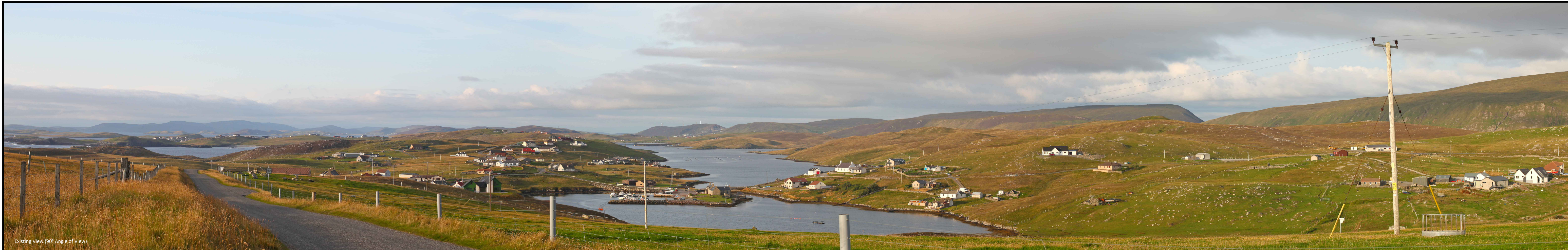
Existing View (90° Angle of View)