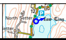
Figure 5.3.12b - Viewpoint 12: Loch of Tingwall View flat at a comfortable arms length. The principal distance is 812.5mm. This image provides landscape and visual context only.