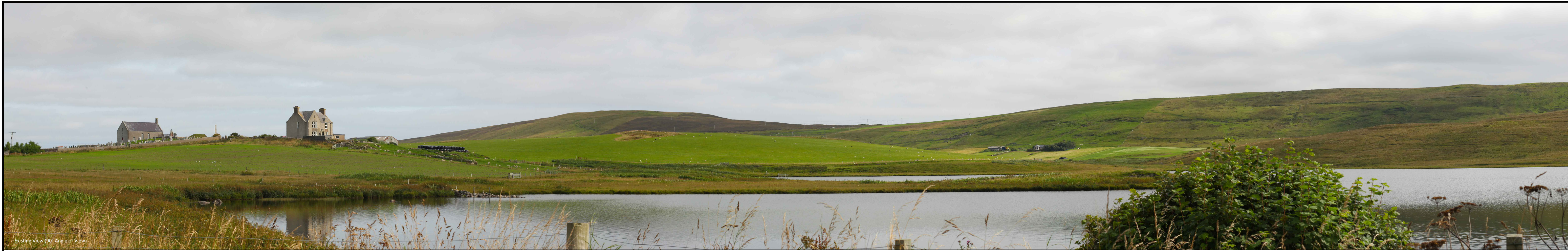
Existing View (90° Angle of View)