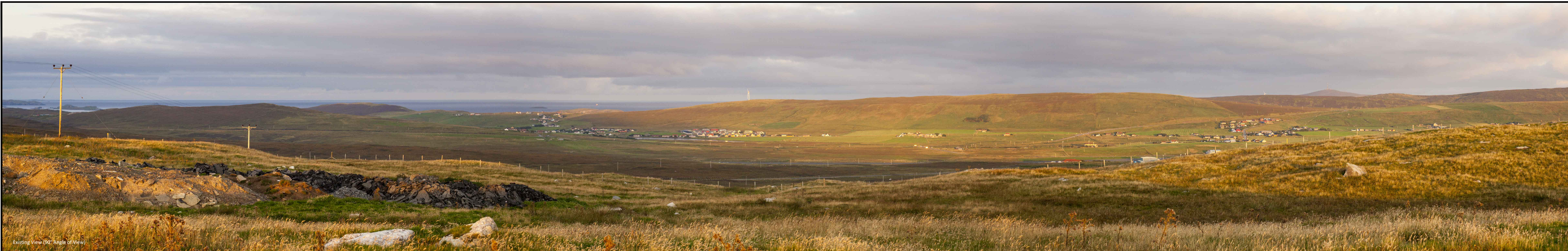
Existing View (90° Angle of View)